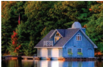
Homes and Cabins