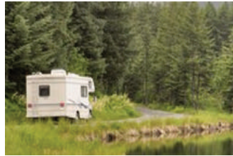
RVs and Campers